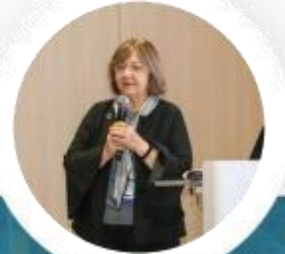
Director, Trade, Investment and Innovation, UNESCAP