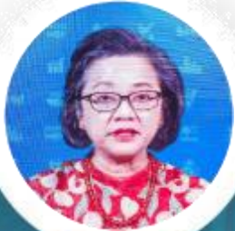
Executive Secretary-General of the United Nations Economic and Social Council for Asia and the Pacific