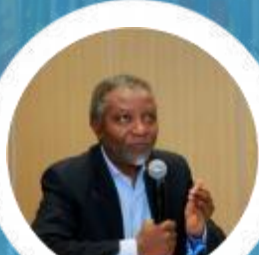
Regional Coordinator for Africa, United Nations Office for South-South Cooperation