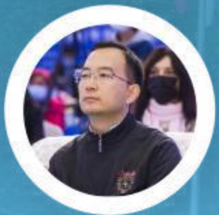
Deputy Secretary of Shenzhen Municipal Committee of the Communist Youth League