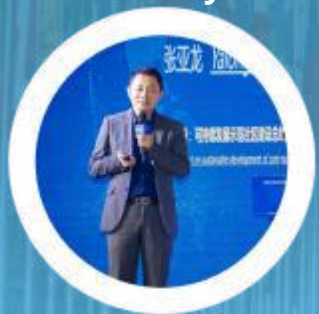
Executive Director, Shenzhen Institute of Sustainable Development