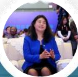
Deputy Director, United Nations Office for South-South Cooperation