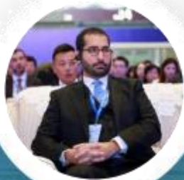
Minister of Youth and Sports Affairs of Bahrain