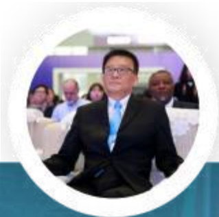
Vice Chairman, Shenzhen CPPCC