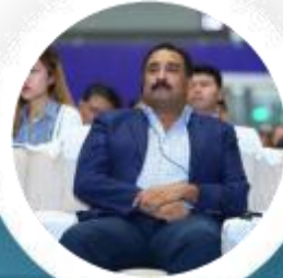
Head of ITPO, Bahrain, UNIDO