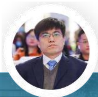
Director, Programme Coordination and Information Division, China Agenda 21 Management Centre