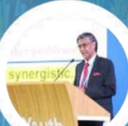
Winner of the Nobel Peace Prize