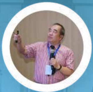
Senior Project Officer, UNDP China Economic Restructuring Programme