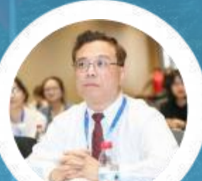
Senior Specialist, World Bank Asia Pacific Sustainable Development Agency