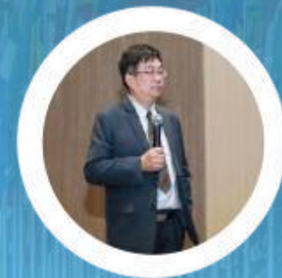
Dean of Sustainable Development Institute of Lake Stone