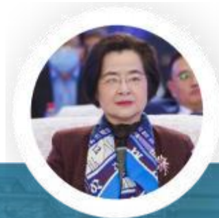
Secretary deputy director of Shenzhen Science and Technology Innovation Committee Party