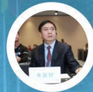
Expert from Foreign Cooperation and Exchange Center of Ministry of Ecology and Environment