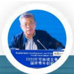
Member of the CPPCC National Committee