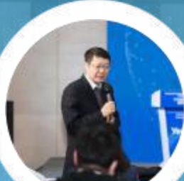
Senior Project Officer, United Nations Chief Technical Adviser